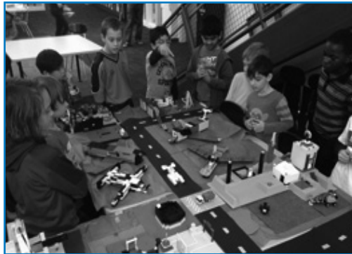
Students in GRC's Fall 2013 Learning Lab class "LEGO® & K'NEX®" admire their transportation constructions.