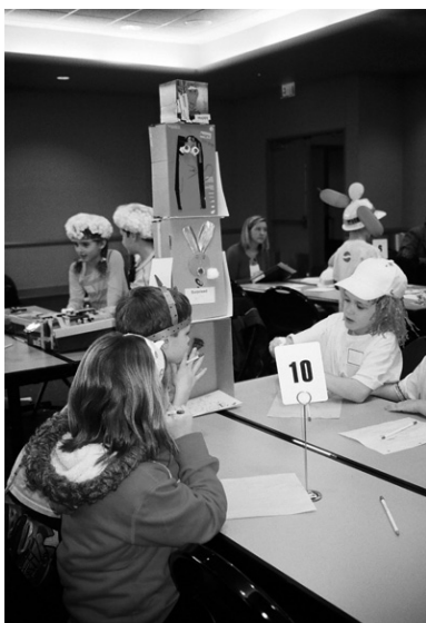
A Creative Convention team plans a presentation about their totem pole of facial expressions.