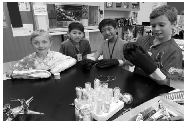
GRC's Pioneer cadets simulate the challenges that astronauts face while working in a space suit.