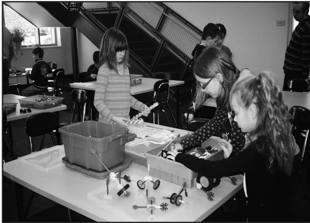
GRC's Saturday Learning Lab classes engage girls in STEM activities.