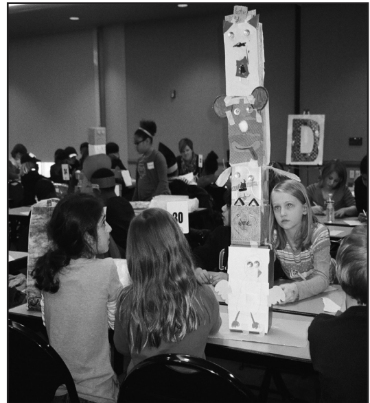
Can a totem pole demonstrate facial expressions and feelings? Creative Convention teams work together to find out.