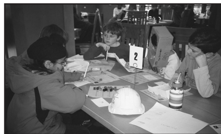
Concentration shows on the faces of these students playing the game of ‘Equations’ at GRC’s Academic Challenge Cup.