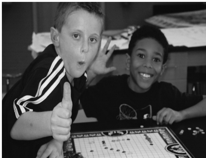
Two Math, Marvels & More “scholars” are happily winning while playing a strategy game.

The GRC instructional philosophy builds on and deepens this emphasis on mutual respect. Teachers challenge students with a cooperative learning problem—such as analyzing the atmosphere of different planets and moons. Then they help the class break the overall challenge into smaller learning tasks, each centered on different learning questions. Working in smaller groups, students begin researching how much the atmosphere varies on the 53 moons of Saturn or how acidic is the rain on Venus if it destroyed a probe in 90 minutes. Periodically the working groups share what they have learned and how that leads to further questions. Every student in the class benefits from what his teammates have discovered. The cooperative learning process continues each day under the guidance of the GRC teacher, and each student continues to benefit intellectually from the contributions of fellow classmates.