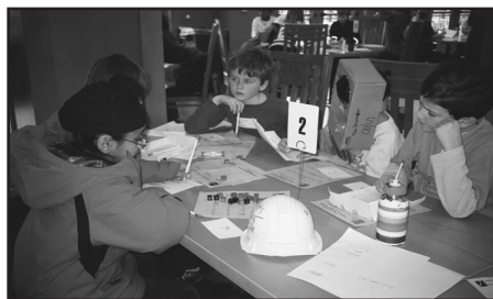
Concentration shows on the faces of these students playing the game of ‘Equations’ at GRC’s Academic Challenge Cup.